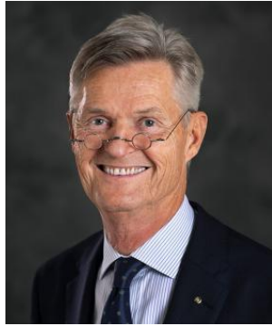
Holger Knaack President 2020-21 April 2021

This year, we celebrate Earth Day on 22 April with a new sense of purpose. The environment is now an area of focus for Rotary. Solutions for all great tasks always start with you and me, and there is much we as individuals can do simply by changing our behavior: Cutting down on our use of plastic and using energy wisely are just two examples. But now we have the opportunity to do more together.